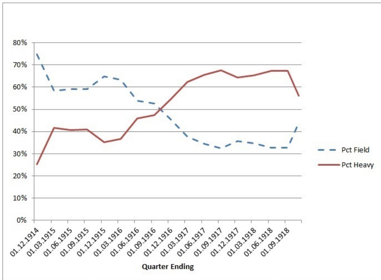
Figure 2: BEF, Artillery Expenditure by Type, 1914-1918 9

In addition, the composition of this ammunition changed drastically over the war. As illustrated in Figure 2, 75 percent of the expenditure in 1914 was field artillery (13-pounder, 18-pounder and 4.5" howitzer). By early 1918 that number had slipped to one third and over the course of the war 62 percent of British tonnage expenditure in France was heavy artillery (4.7" guns and 60-pounders through 15" howitzers). 10 The truly staggering thing to note about Figure 1 is how Britain's expenditure accelerated so dramatically from the second quarter of 1917. We are used to thinking of the battle of the Somme as a vast artillery struggle. While it did represent an order of magnitude increase over earlier battles, the engagements in 1917 and 1918 saw that kind of order of magnitude increase again. While the BEF did expand from roughly 1.6 million to just over 2 million men from 1917-18, this growth does not explain the dramatic change in ammunition expenditure. The growth in ammunition expenditure can be more accurately tied to the rationalization of the BEF's lines of communication following a near-breakdown during the Somme offensive. This allowed them to maintain in 1917 and 1918 a level of ammunition expenditure commensurate with